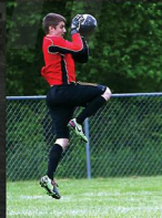
Specialized Goal Keeper Training